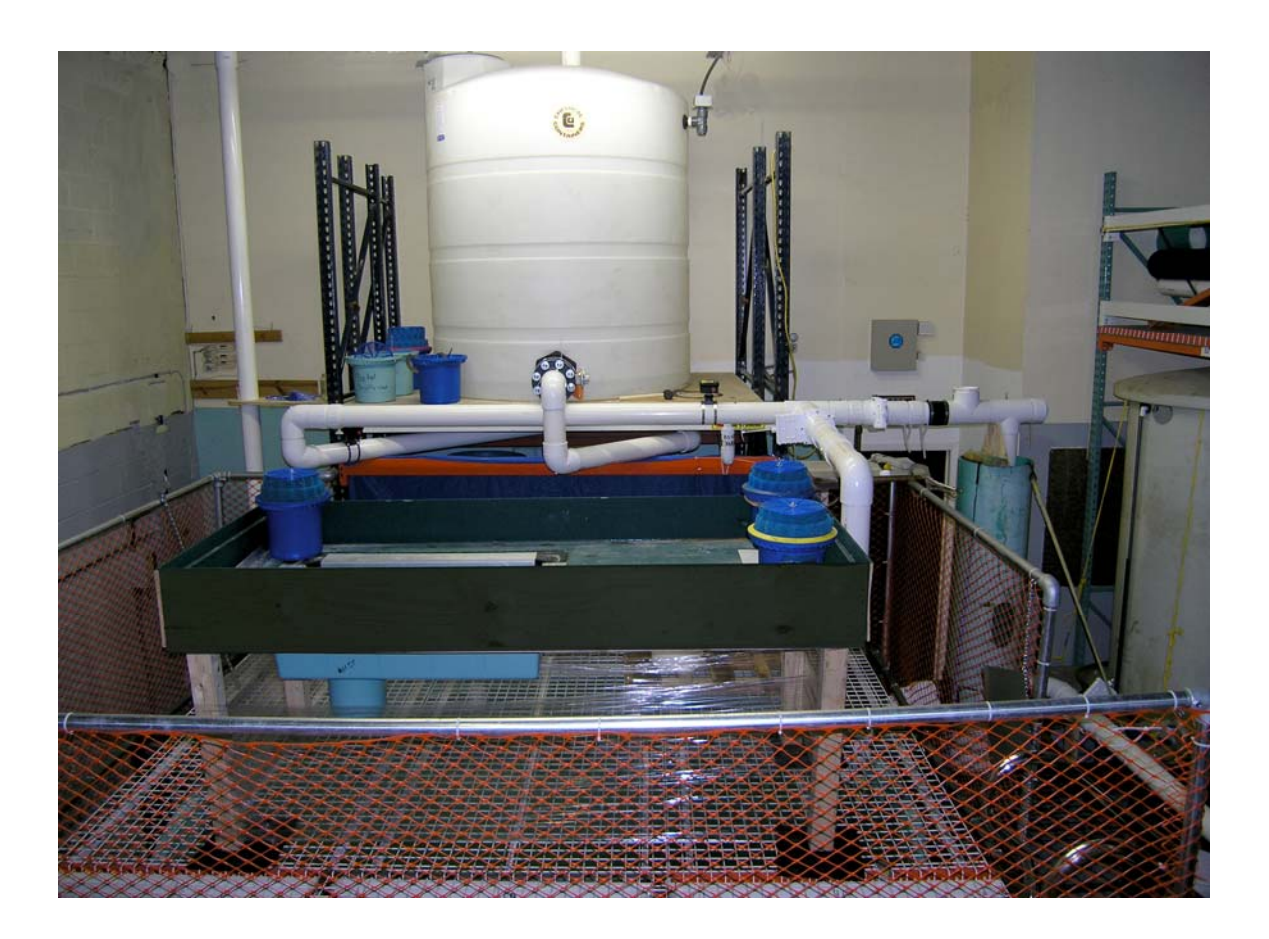
Appendix B Fabco Re-circulating Hydraulic Test Rig – Image 1 Bohemia, NY